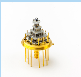
Photodetectors by VIGO System S.A.

Towards this end, there has been growing interest in expanding spectroscopic methods beyond the 2 \mu\text{m} range of the infrared spectrum and up to the 12 \mu\text{m} wavelength. Unfortunately, water itself is a very strong absorber of infrared light. Thus, since available infrared light sources provide only insufficient power, comparable methods are restricted to strongly confined laboratory settings